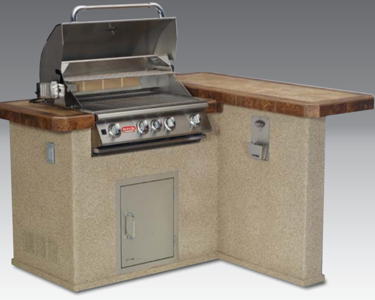
Item# 31086, Countertop -30" x 65.25" x 60" / Base 27.5" x 48.25" x 57"